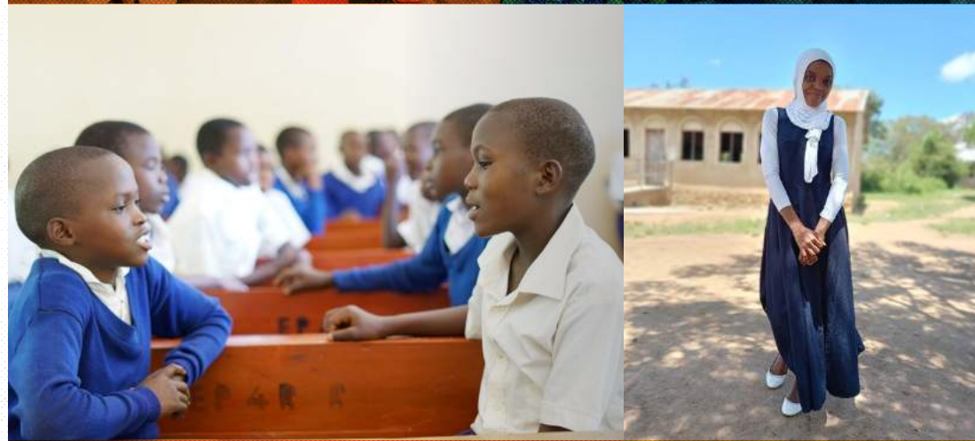
STUDENTS PRACTICING PAIRED TALK