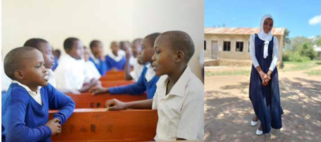
STUDENTS PRACTICING PAIRED TALK