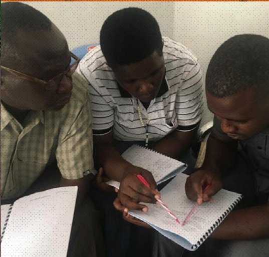
WORKING WITH TEACHERS