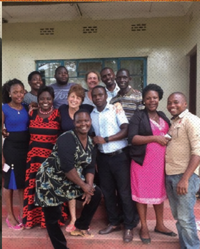
ENGLISH BRIDGE TEACHERS & VOLUNTEERS