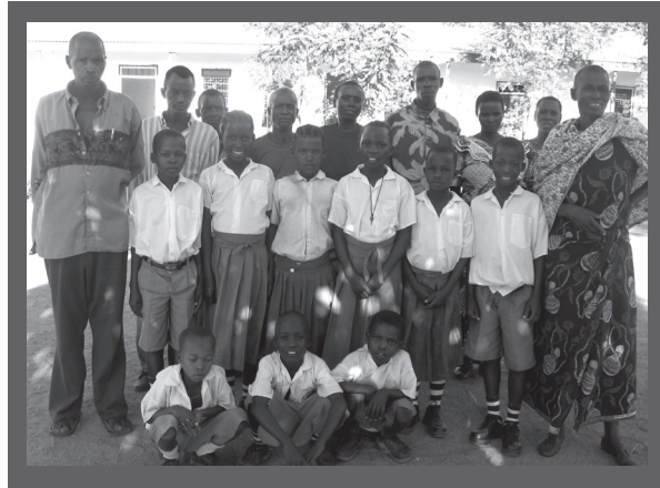
PZ students at Mihingo Primary School with their guardians