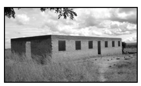
First wing of girl's dorm this April, ready for finishing.