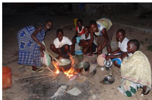
PZ students cooking outside together at VTC dormitory during rainy season.

Need: For the 2015 school year, it is estimated that 46 Project Zawadi students will be studying at the VTC and living in the dormitories. Currently, the facility has no kitchen or dining room to serve these students and students have been cooking individually outside in all types of weather. In 2014, a generous donor funded a water catchment and storage system which was installed at the boys' dormitory. It was known at the time that this would not meet the entire water needs for the dormitory campus. Zinduka has therefore been paying to have supplementary water hauled to the VTC for drinking, washing and laundry .