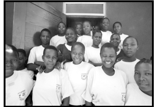
Makongoro Secondary School female students pose after exploring their new residence hall

For the first time in the school's 16-year history, Makongoro Secondary School's girls can focus all their energies on their studies. No more anxiety-filled searches for lodging in town, hour-long walks to and from class, and fears of harassment from strangers. 50 girls, including 2 PZ students, now live and learn in their on-campus residence hall.