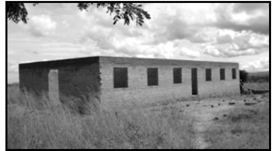
First wing of girl's dorm this April, ready for finishing.